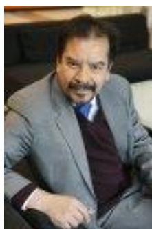
Prof. Enrique Acha

Abstract: Continuous increases in electrical energy consumption have encouraged a great deal of technological development in the electrical power industry. In particular, the development of new equipment for power transmission that enables a more flexible power grid aimed at achieving higher throughputs, enhancing system stability and reducing transmission power losses, has been high on the agenda. The VSC-HVDC link is the latest equipment developed in the arena of high-voltage, high-power electronics and its intended function is to transport electrical power in DC form, as well as to enable the asynchronous interconnection of otherwise independent AC systems, and to provide independent reactive power support. The technology employs Insulated Gate Bipolar Transistors (IGBTs), driven by pulse width modulation (PWM) control. This valve switching control permits to regulate dynamically, in an independent manner, the reactive power at either