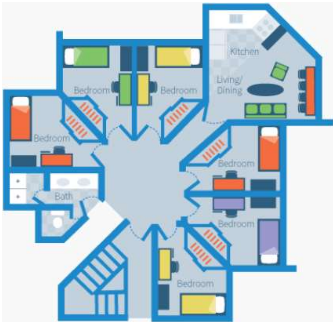
The general layout of an apartment with cooking facilities

Should all semi-private style units reach capacity, students will be placed in traditional dormitories.