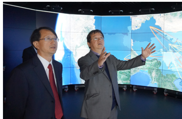
Rector of ZJU visit DSI

For more information, please download the booklet about the Data Science Institute (2.4MB)